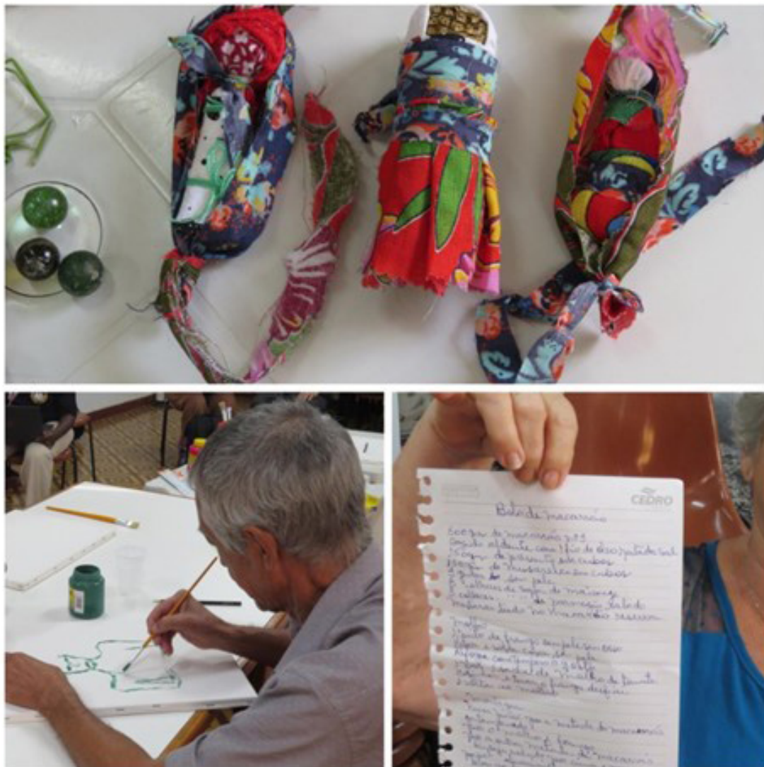
Figure 1. Affective childhood toys, painting workshop, and recipe handwritten by the participant. Botucatu, São Paulo, Brazil, 2024.

This moment reinforced participants' feelings of belonging, recognition, and self-esteem, as evidenced by expressions of pride and gratitude captured in images.