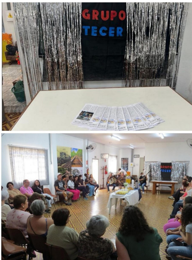
Figure 2. Newspaper launch. Botucatu, São Paulo, Brazil, 2024.