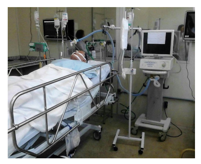
Figure 1. Simulated scenario of Intensive Care. Alfenas, MG, Brazil, 2017

The case referred to a 60-year-old male patient with a diagnostic hypothesis of septic shock with pulmonary focus. He was hemodynamically unstable, hypotensive even with vasoactive drugs, with a cardiac rhythm of atrial fibrillation with